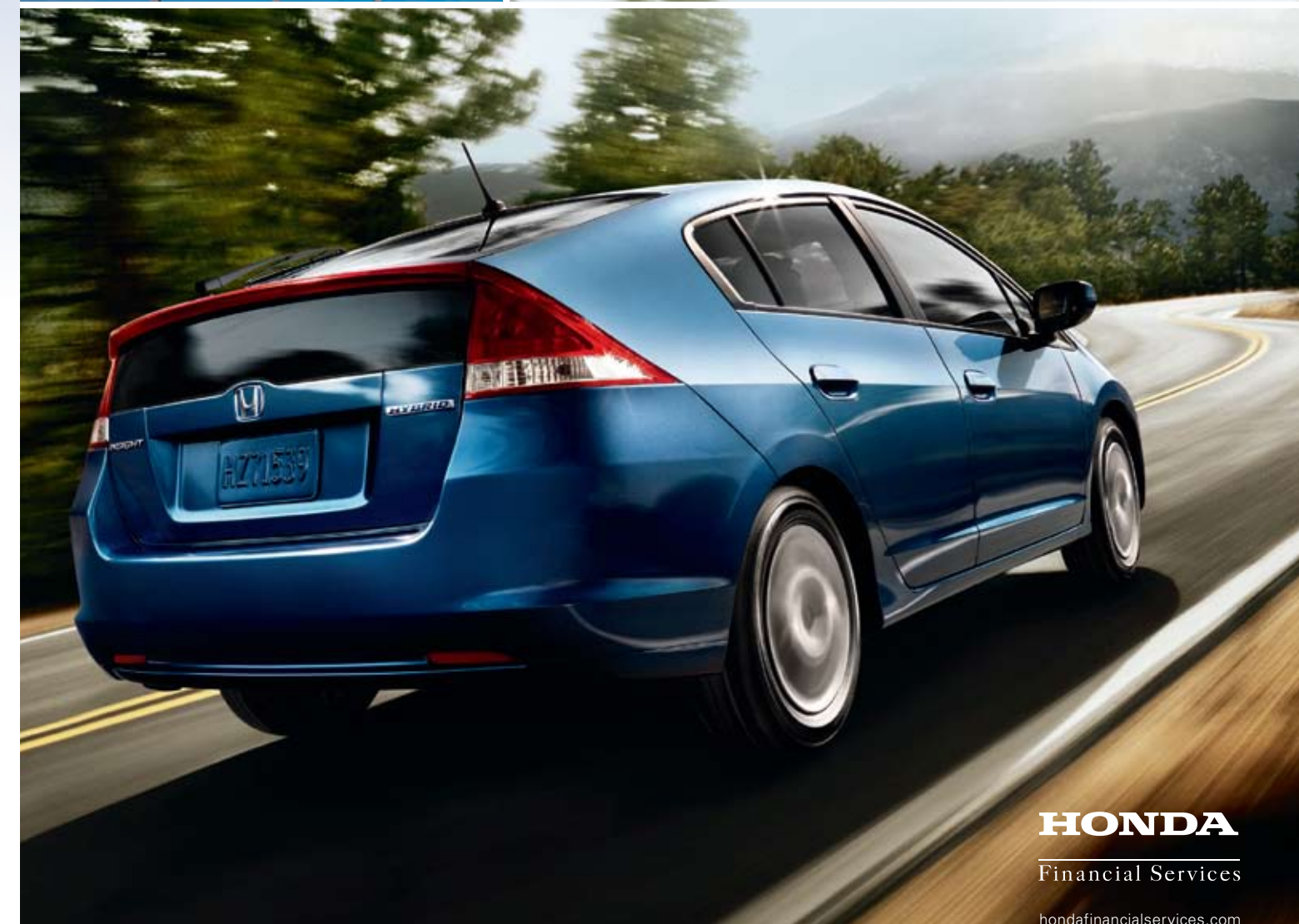
Insight LX shown in Atomic Blue Metallic.